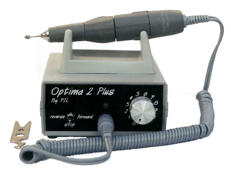
The Optima 2 Plus Power supply with 45,000 RPM Handpiece