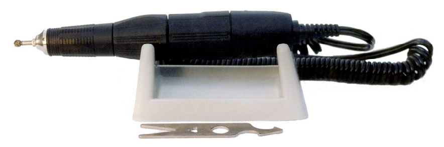
The Optima 2 Plus "Standard" 35,000 RPM Handpiece

Read all of these instructions carefully before using