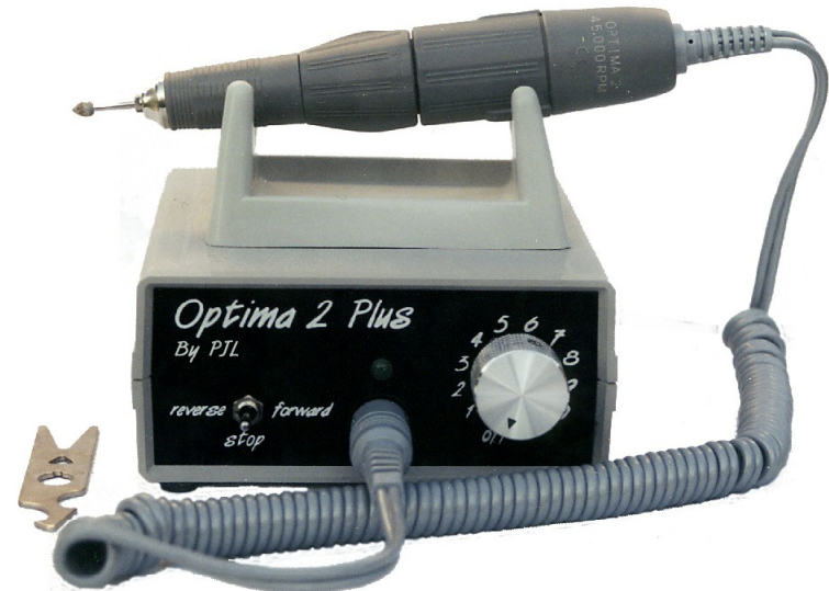
The Optima 2 Plus Power supply with 45,000 RPM Handpiece